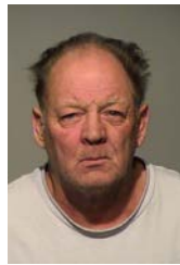
Schwichtenberg – DUI-3 rd

Milwaukee, WI – Acting Sheriff Richard Schmidt ordered increased Labor Day weekend Drive Sober patrols beginning on Friday, September 1, through Tuesday, September 5 at 6:00 a.m. The initiative focused on keeping the public safe through increased traffic enforcement.